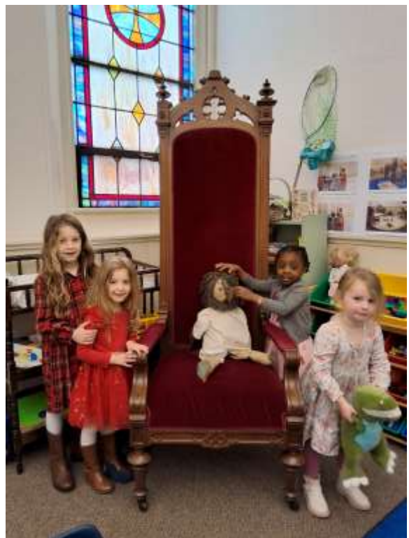
Sunday School – May 3, 2026

On Saturday, May 9 th , we will participate in the Freehold Borough town-wide yard sale. Tables are provided. Come between 7:00 and 9:00 AM on May 9 th to set your table up. Kindly note that any unsold items will need to be removed at the conclusion of the yard sale. You may either take them home or they can be disposed of. If it rains, FPC will not be participating in the yard sale.