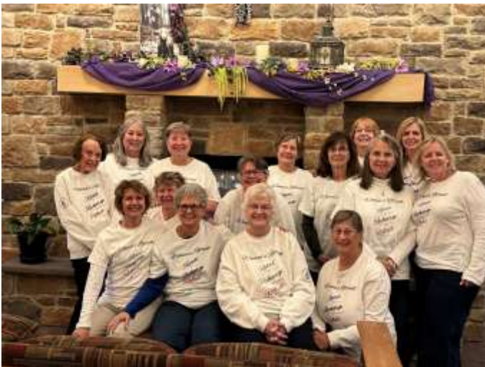
May 2026 Women's Retreat

A group of our women members and friends were away the first weekend in May for their annual spiritual retreat in the Poconos. A time for fellowship. A time to relax, recharge and reflect.