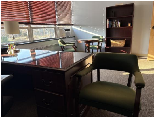
March 20, 2026