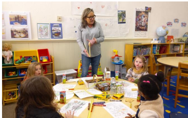
Sunday School – March 29, 2026

Children are invited to the Sunday worship service in the sanctuary at 10:00 AM and then they can go to Sunday School after the Time for Children message.