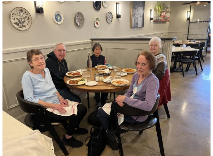
March 19, 2026