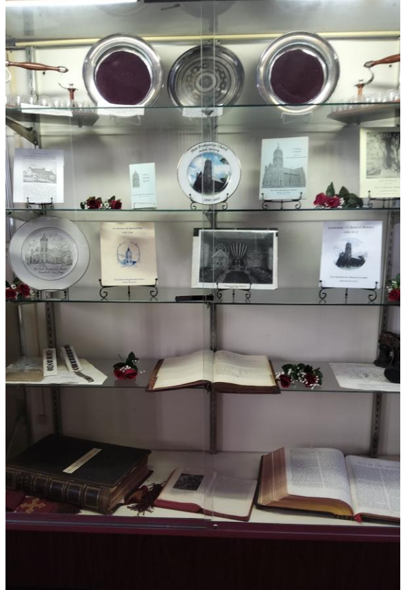
February 2025 display case in the sanctuary

February is FPC's anniversary month. One hundred and eighty-seven years! That's a lot of history and the theme of this month's display. There is also a photo of the 1897 Washington's Birthday celebration held in the sanctuary.