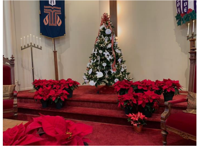
FPC Sanctuary – December 24, 2023

The poinsettias decorated the sanctuary through the Christmas Eve worship service, and some were later delivered to those unable to worship in person.