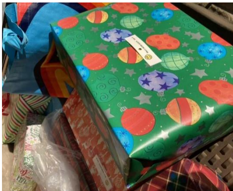
Gifts for the kids

Gift cards totaling $1,825 and Christmas gifts for little kids were delivered to the Community Affairs & Resource Center (CARC) in Freehold with our love and God's.