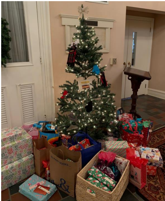
Angel Giving Tree – FPC Narthex

Gift cards totaling $1,825 and Christmas gifts for little kids were delivered to the Community Affairs & Resource Center (CARC) in Freehold with our love and God's.