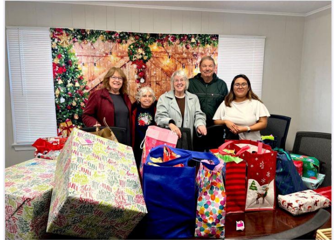
Your Mission/Outreach Commission at work, loving our neighbors at CARC in Freehold.

CARC shared their gratitude and sincerest thank you to FPC for the Christmas donations for families in need. Helping to provide toys, coats and food to our community!