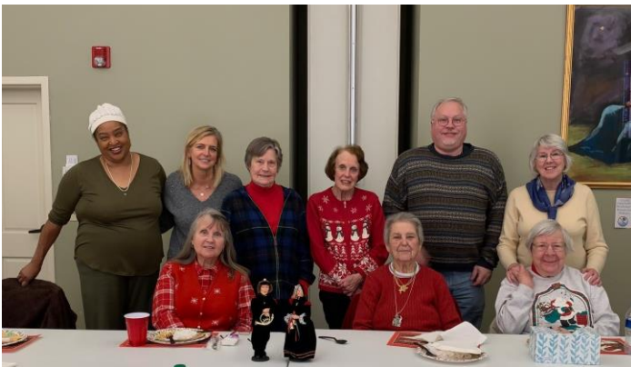
December 20, 2023

Recently, the group shared some food and fellowship with a Christmas luncheon.